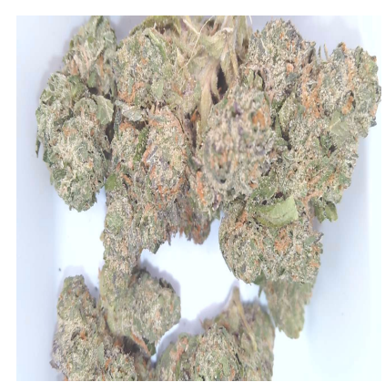
SERVING MASS (g): 1.00 SERVINGS/UNIT: 1

The statements and results herein have not been approved and/or endorsed by the FDA.