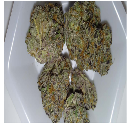
SERVING MASS (g): 1.00 SERVINGS/UNIT: 1