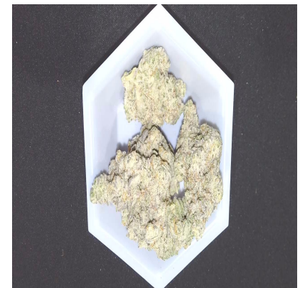
SERVING MASS (g): 1.00 SERVINGS/UNIT: 1