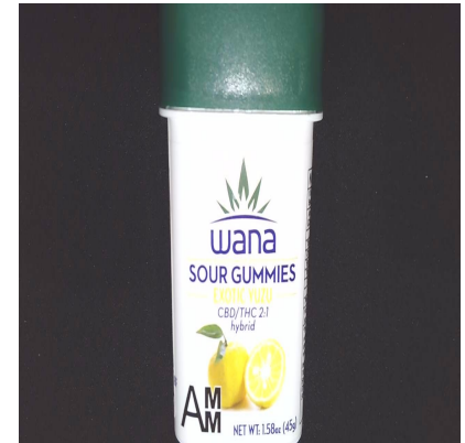
SERVING MASS (g): 4.81 SERVINGS/UNIT: 10