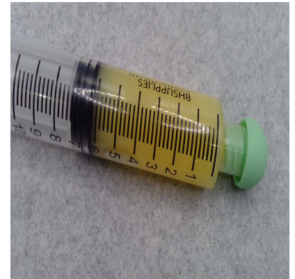
SERVING MASS (g): 1.50 SERVINGS/UNIT: 60