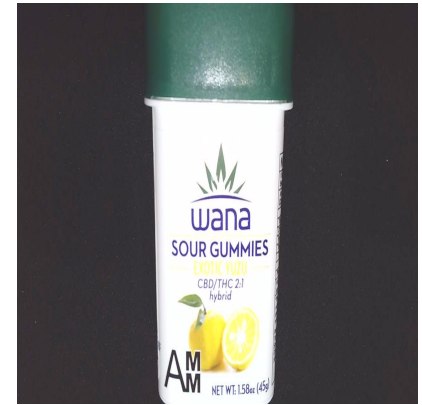
SERVING MASS (g): 4.89 SERVINGS/UNIT: 10