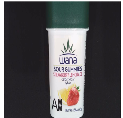
SERVING MASS (g): 4.70 SERVINGS/UNIT: 10