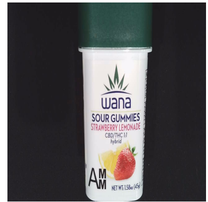
SERVING MASS (g): 4.78 SERVINGS/UNIT: 10