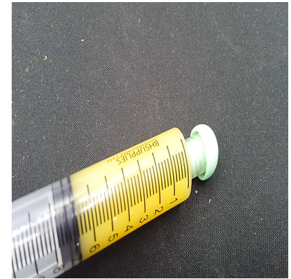
SERVING MASS (g): 1.50 SERVINGS/UNIT: 60