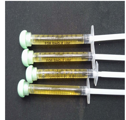
SERVING MASS (g): 1.00 SERVINGS/UNIT: 1