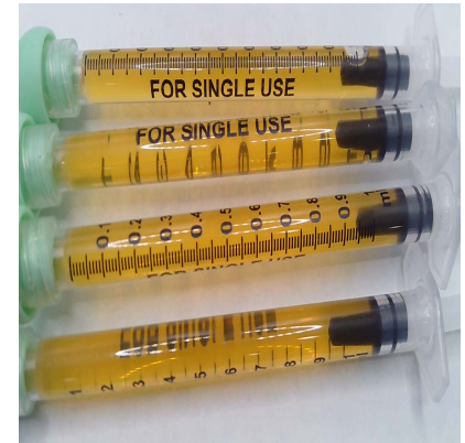
SERVING MASS (g): 1.00 SERVINGS/UNIT: 1