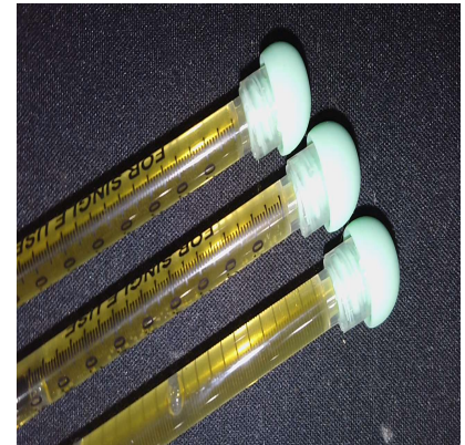
SERVING MASS (g): 1.00 SERVINGS/UNIT: 1