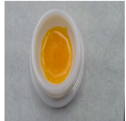
SERVING MASS (g): 1.00 SERVINGS/UNIT: 1