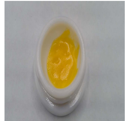
SERVING MASS (g): 1.00 SERVINGS/UNIT: 1