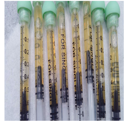
SERVING MASS (g): 1.00 SERVINGS/UNIT: 1