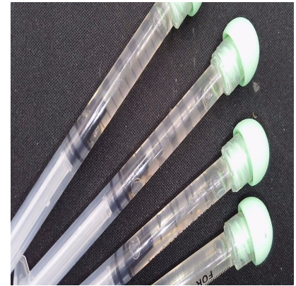
SERVING MASS (g): 1.00 SERVINGS/UNIT: 1