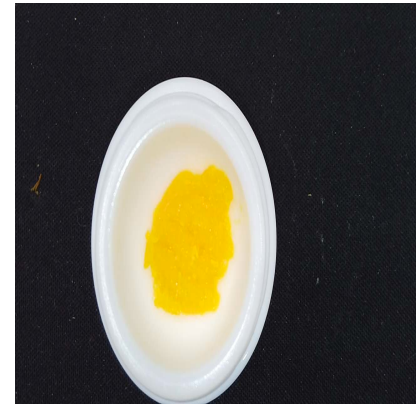
SERVING MASS (g): 1.00 SERVINGS/UNIT: 1