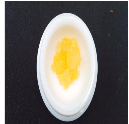
SERVING MASS (g): 1.00 SERVINGS/UNIT: 1