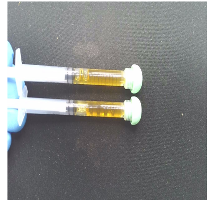
SERVING MASS (g): 1.00 SERVINGS/UNIT: 1