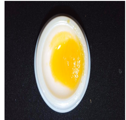
SERVING MASS (g): 1.00 SERVINGS/UNIT: 1