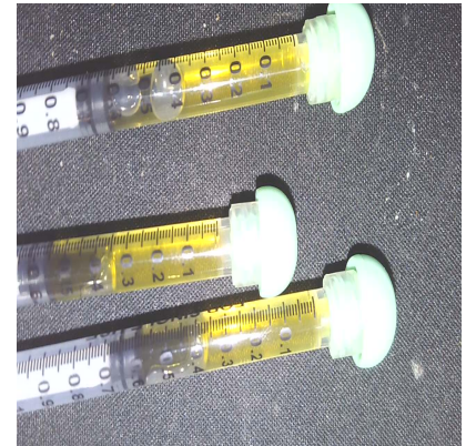
SERVING MASS (g): 1.00 SERVINGS/UNIT: 1