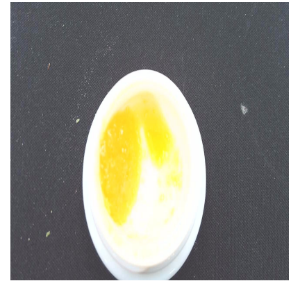
SERVING MASS (g): 1.00 SERVINGS/UNIT: 1