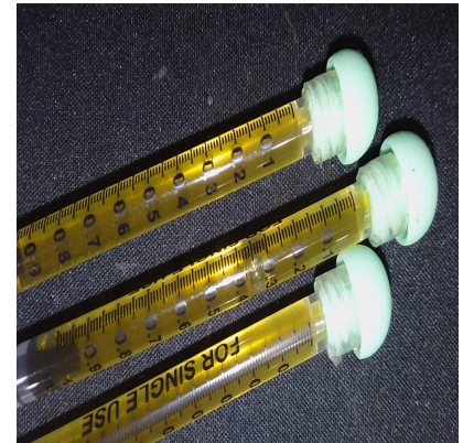
SERVING MASS (g): 1.00 SERVINGS/UNIT: 1