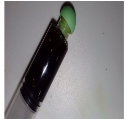
SERVING MASS (g): 1.00 SERVINGS/UNIT: 1